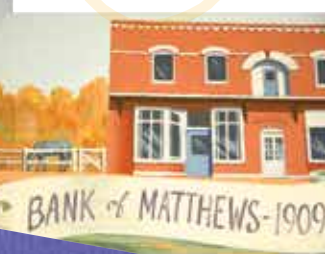
BANK of MATTHEWS-1909