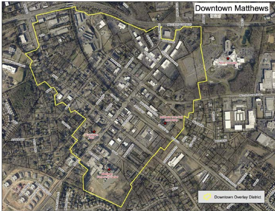
Matthews Downtown Overlay District